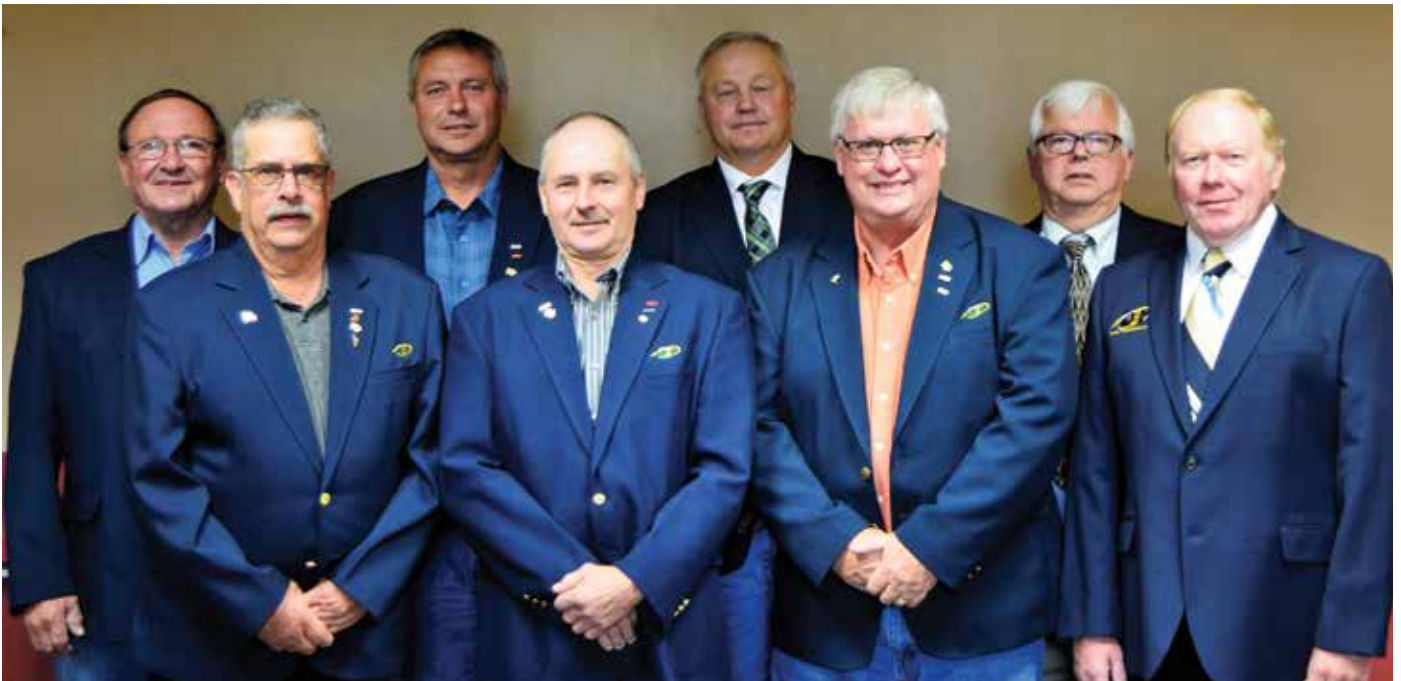
Your Dunn Energy Cooperative Board of Directors

As I said above, October is National Cooperative Month. It's a time when cooperative organizations nationwide join together to celebrate and to thank their members. Along with other area cooperatives, Dunn Energy will again be sponsoring a co-op breakfast on Saturday, October 28, to express our appreciation to our members. The only reason Dunn Energy exists is to serve you, our members and this is our way of saying thanks to our members for all that they do for their cooperative. Hope to see you on October 28!